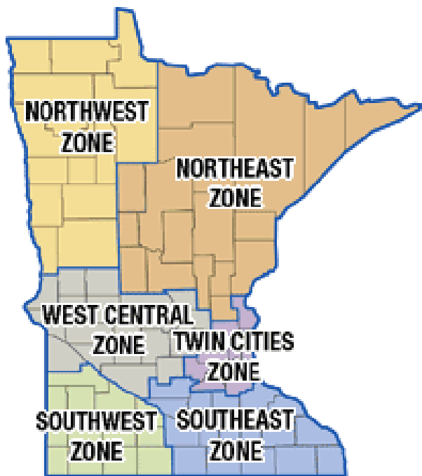
MTO ZONE MAP