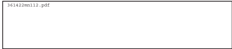
Name of Attached Document

<112> Attach Five-Year Service Quality Improvement Plan or, in subsequent years, your annual progress report filed pursuant to 47 C.F.R. § 54.313(a)(1). If your company is a CETC which only receives frozen support, your progress report is only required to address voice telephony service.