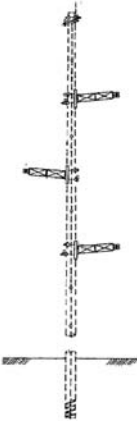
Typical Monopole Tangent Structure