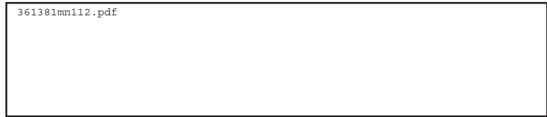
Name of Attached Document

<112> Attach Five-Year Service Quality Improvement Plan or, in subsequent years, your annual progress report filed pursuant to 47 C.F.R. § 54.313(a)(1). If your company is a CETC which only receives frozen support, your progress report is only required to address voice telephony service.