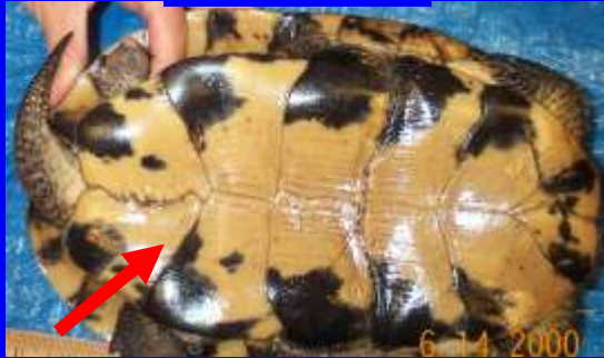
Male=concave Plastron Female=flat

Carapace (upper shell): Round, dome-shaped, very smooth, dull black with specks and streaks of yellow throughout.