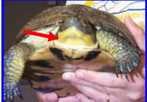
Yellow neck/chin; no stripes

The bright yellow chin and underside of the long neck is one of the most conspicuous features of this turtle. Marshes, ponds, rivers & streams, adjacent uplands; Also travel overland & cross roads. May bask on logs, shore