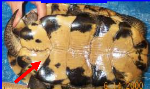
Male=concave Plastron Female=flat

Carapace (upper shell): Round, dome-shaped, very smooth, dull black with specks and streaks of yellow throughout.