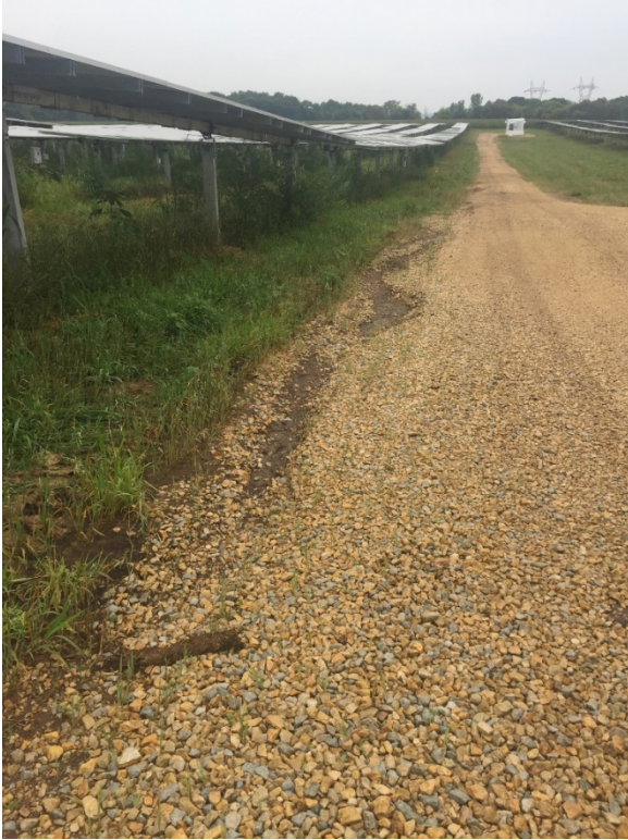
Photo 1: Small erosion channel beginning to establish along central access road.