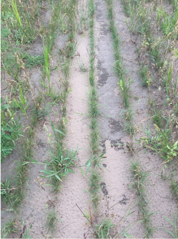
Photo 4: Vegetation emergence in blow-sand accumulation area; establishment is a little slower but dense vegetation is present along drill marks and is expected to provide effective stabilization against further wind erosion.