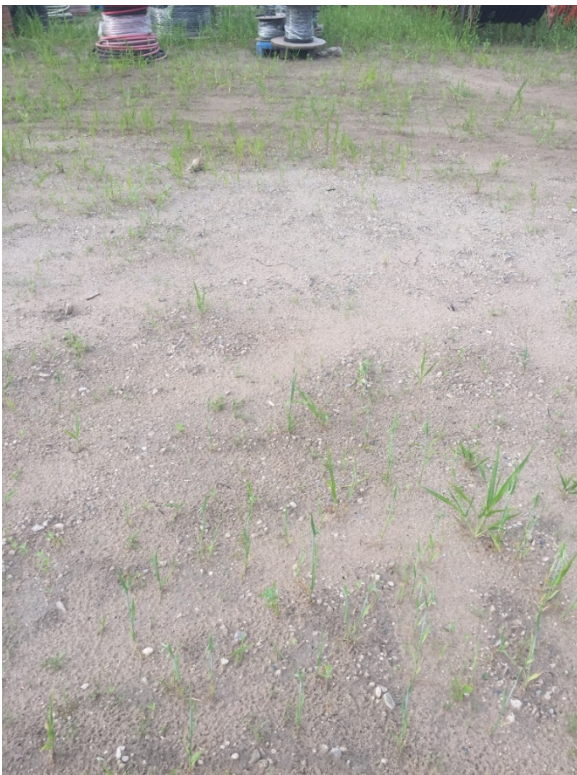
Photo 5: Portions of laydown area have insufficient vegetation establishment due to excessive gravel or vehicle damage.