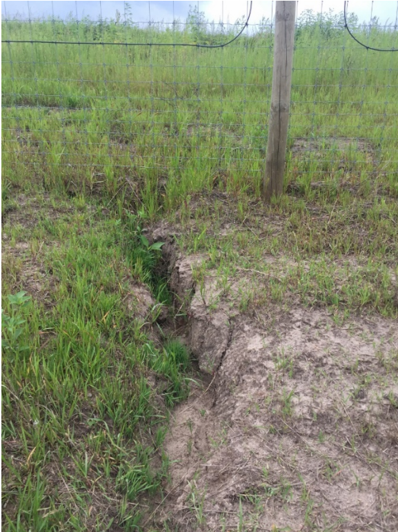
Photo 2: Erosion beginning to increase on southwest corner of site.