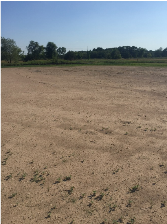
Photo 1: Former laydown area has excessive gravel remaining on surface of topsoil.