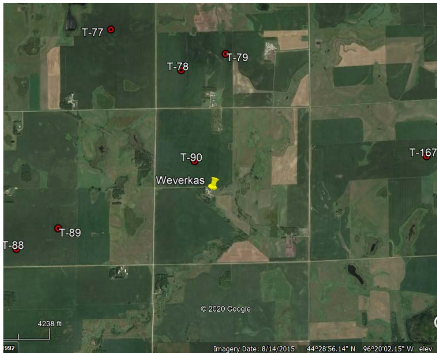
FIGURE 2: WIND TURBINE GENERATOR LOCATIONS RELATIVE TO PROPERTY