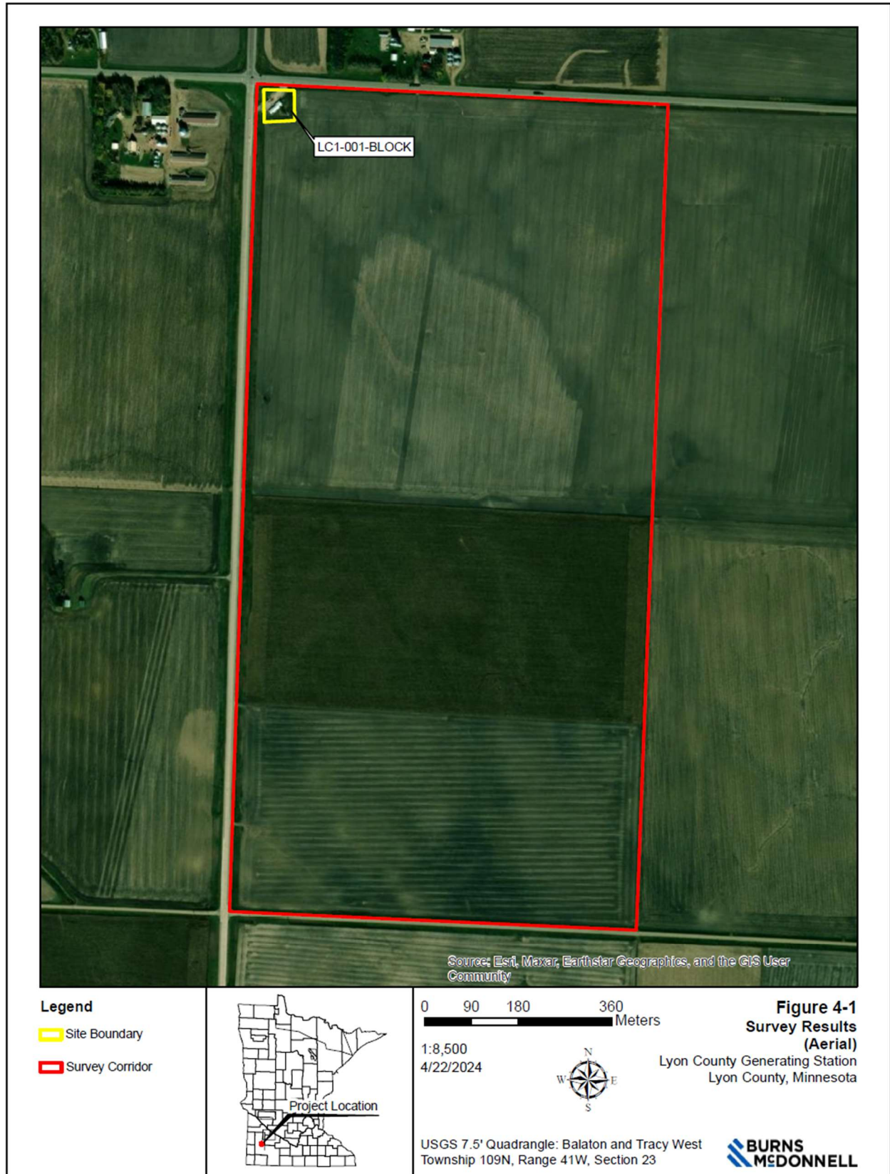
Figure 6-1: Survey Results (Aerial)