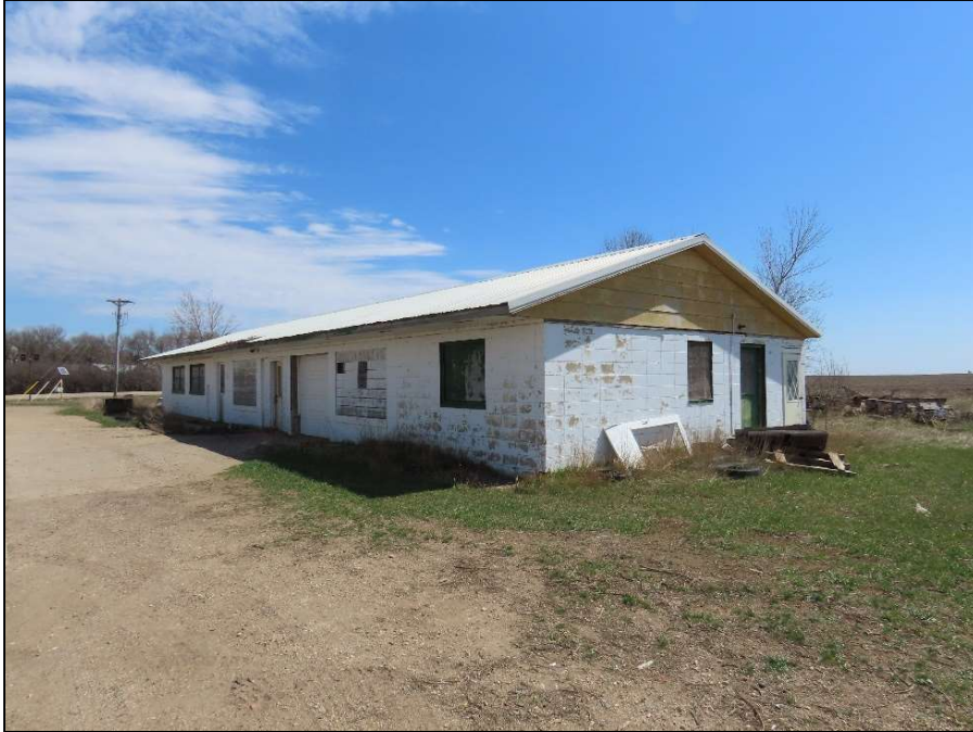
Photograph 6-2. Overview of F.2, the trash pile and the rear (southeast) elevation of F.1, facing northeast.