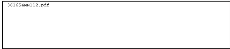
Name of Attached Document

<112> Attach Five-Year Service Quality Improvement Plan or, in subsequent years, your annual progress report filed pursuant to 47 C.F.R. § 54.313(a)(1). If your company is a CETC which only receives frozen support, your progress report is only required to address voice telephony service.