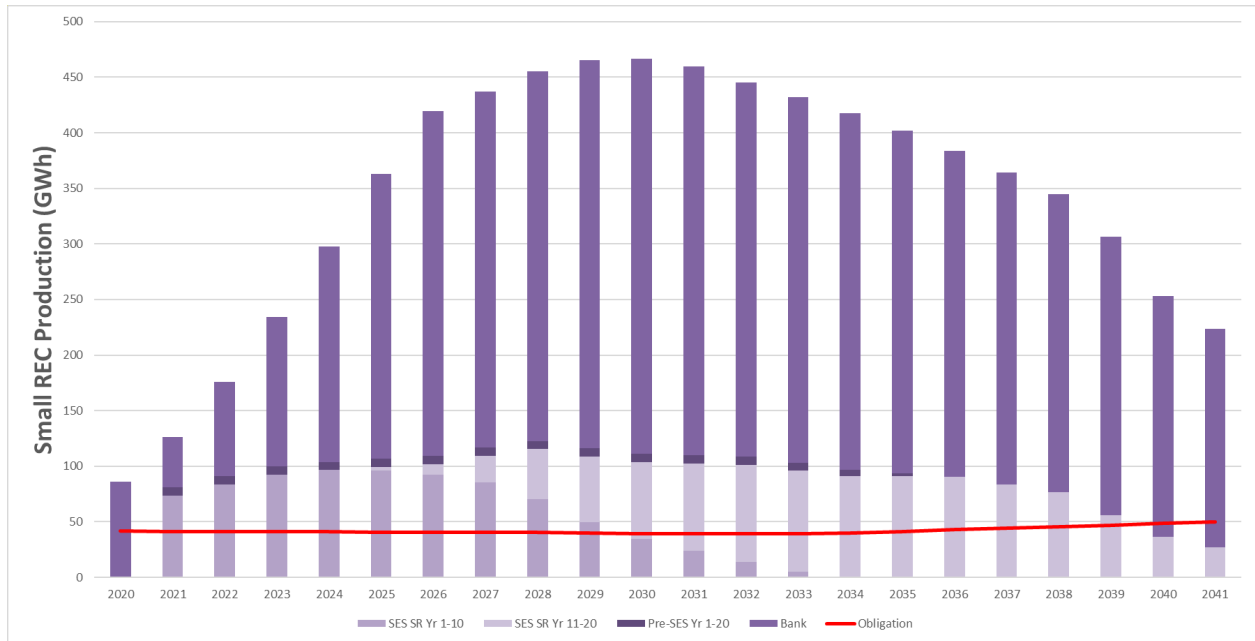
Graph 2 2 Small SREC Production with Solar*Rewards Program Extension with Buy-Back Option

Also, the above analysis is based on the understanding that the nameplate capacity for purposes of this statute is measured in alternating current (AC). This is consistent with the definition of capacity in Minn. Stat. § 216B.164, Subd. 2a.(c), as well as how capacity is used or interpreted under the following statutes: Minn. Stat. §§ 216B.1611, Subd.2(a), and Subd.3a(a)(1); 216B.1613; 216B.164, and Subd. 4c; 216B.1641 (b).