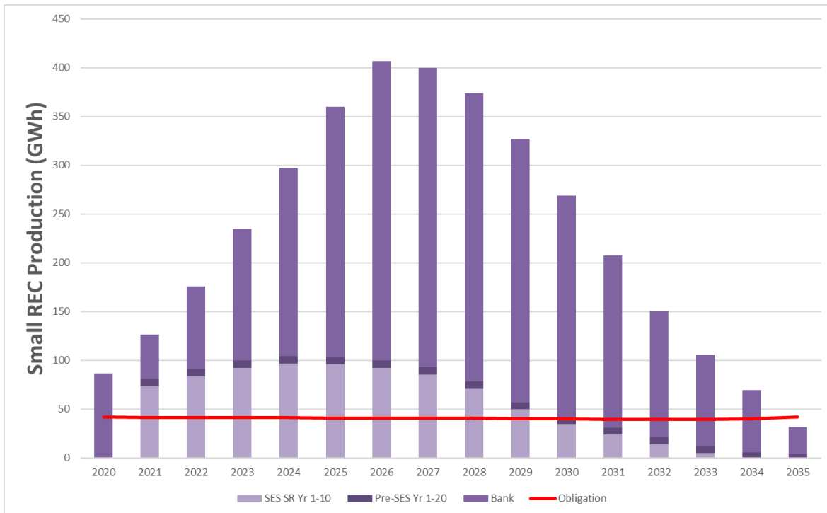
Graph 1 1 Small SREC Production with Solar*Rewards Program Extension through 2022

The chart above assumes 100 percent of funds are awarded and that of these there will be an installation rate of 75 percent for the Solar*Rewards program. The Solar*Rewards program awarded 100 percent of the 2018 funding. If actual solar installations are lower than forecasted levels, the Company may not be able to meet the small solar carve-out requirements through 2034 as projected in the chart above.