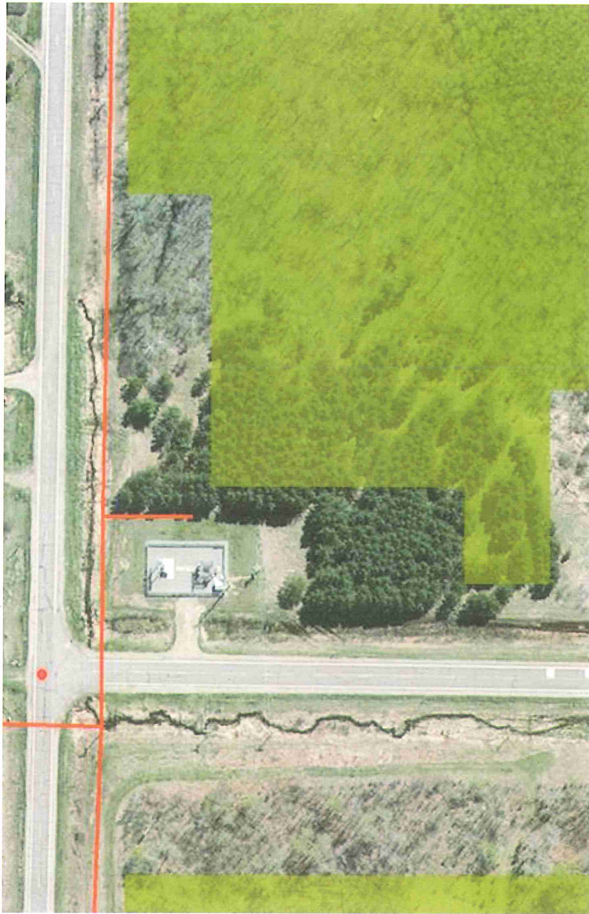
Figure 1 – Boundary of Central Region Regionally Significant Ecological Area (green) in vicinity of Minor Alteration 2.