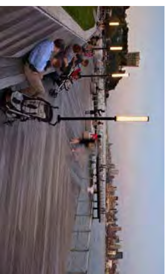
Precedent Image of Allegheny Riverfront Park, Pitsburgh, PA