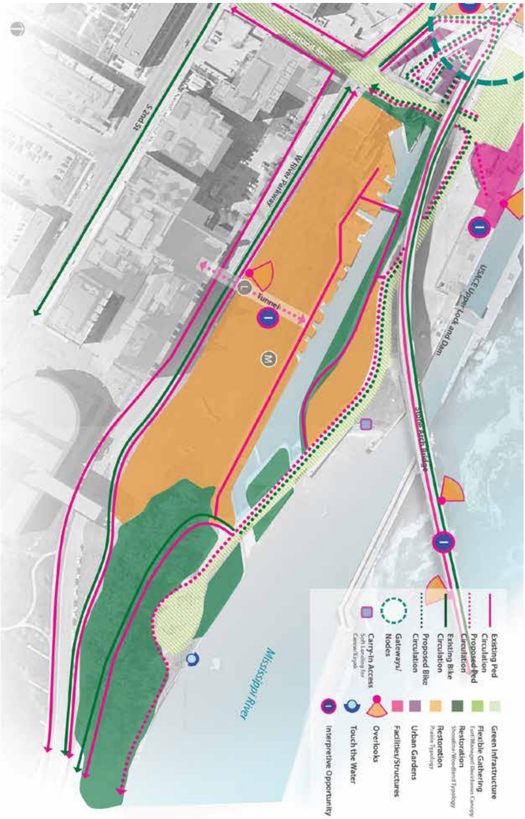
Figure 34 : Lower Mill Ruins Park Recommendations