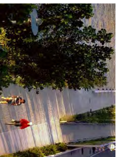
Precedent Image of Allegheny Riverfront Park, Pitsburgh, PA