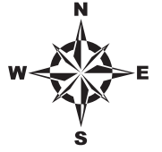
Figure 1-1 Pilot Knob to Burnsville Rebuild and Upgrade Project Proposed Alignment Dakota County, Minnesota