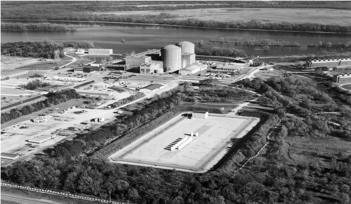
Figure 3.1 Prairie Island Plant and ISFSI