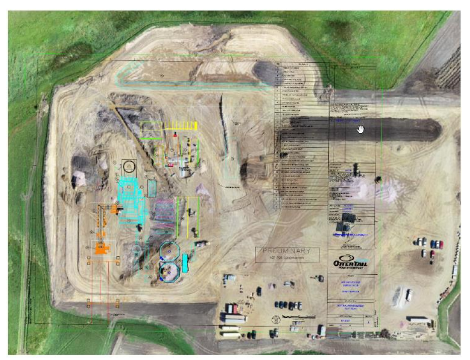
Site activity with project drawing overlay on 8/15/2019