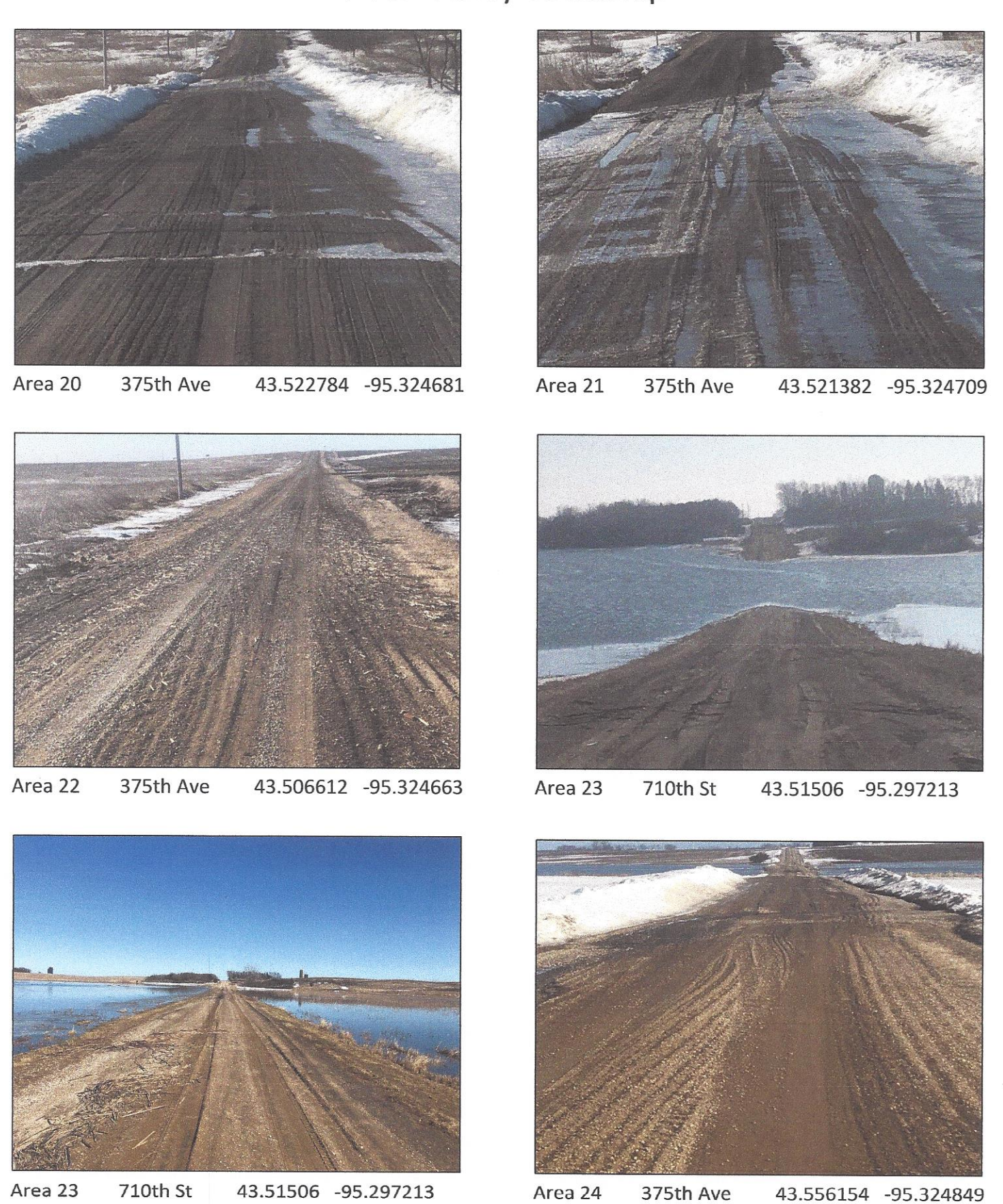
Page | 6