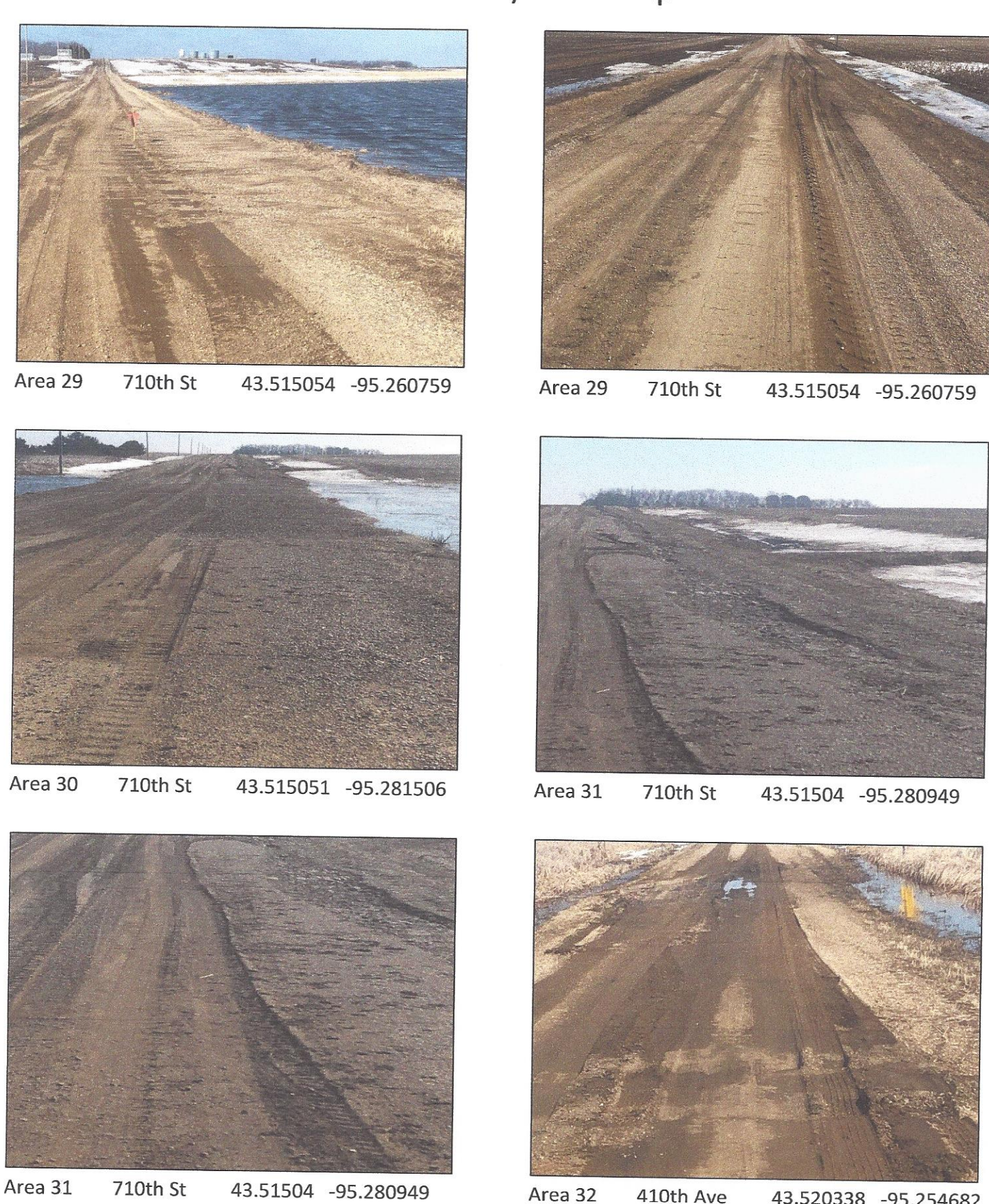
Page | 8