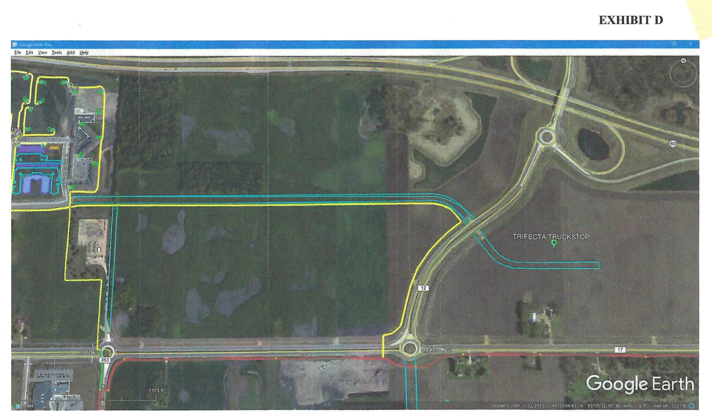
Trifecta Truck Stop on mid-right side. Yellow and red lines show GMG facilities. Purple buildings are currently served by GMG. CenterPoint presumably intends to parallel GMG's facilities running on the south side of Adams across the middle of the map.

Docket No. G002, G008/C-20-795 Public Attachment # 11 Page 1 of 1