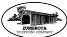
Exhibit 1 for Zumbrota Telephone Company Website page on Lifeline Service