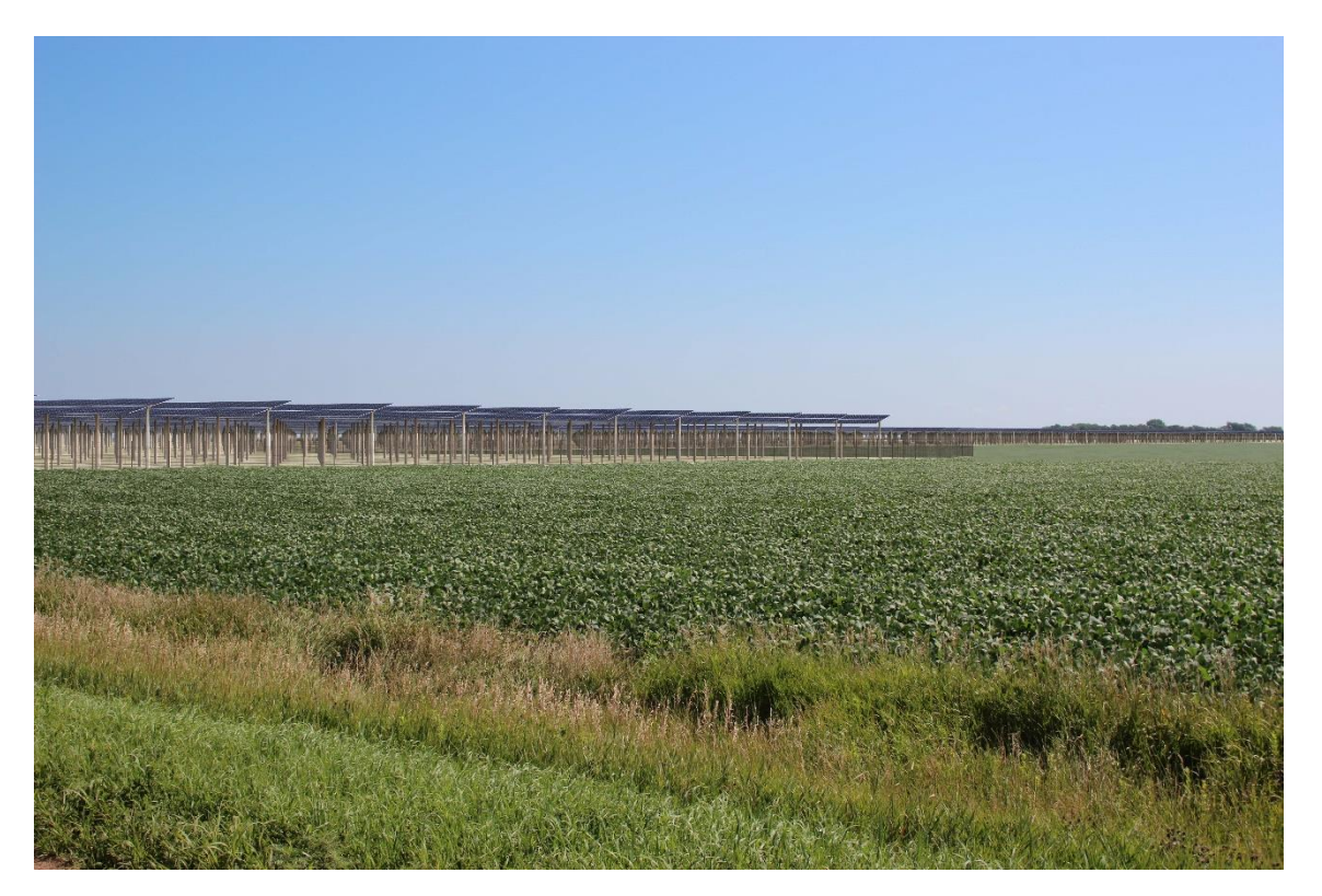
Image 7: Visual Rendering of Red Rock Solar Project from CSAH 8 (600<sup>th</sup> Avenue) Looking Northeast