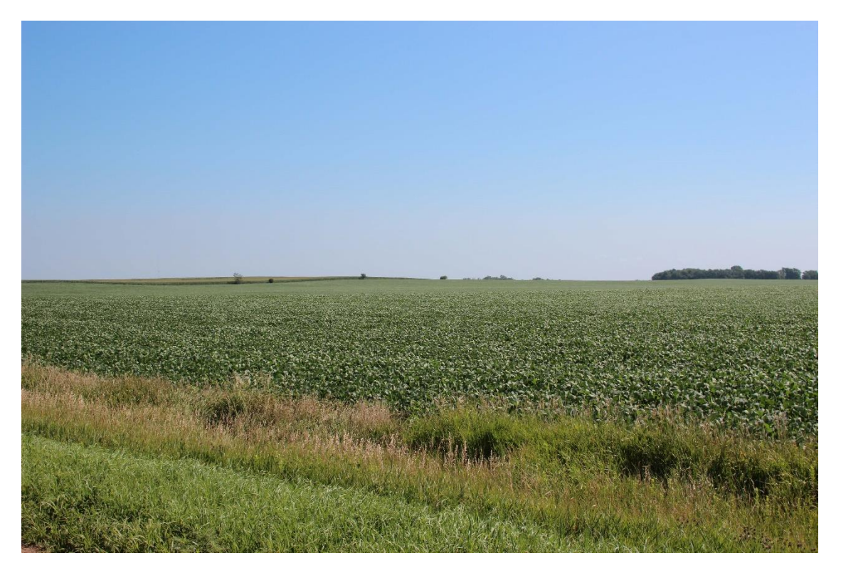
Image 6: Current Conditions from CSAH 8 (600<sup>th</sup> Avenue) Looking Northeast

Image 7: Visual Rendering of Red Rock Solar Project from CSAH 8 (600<sup>th</sup> Avenue) Looking Northeast