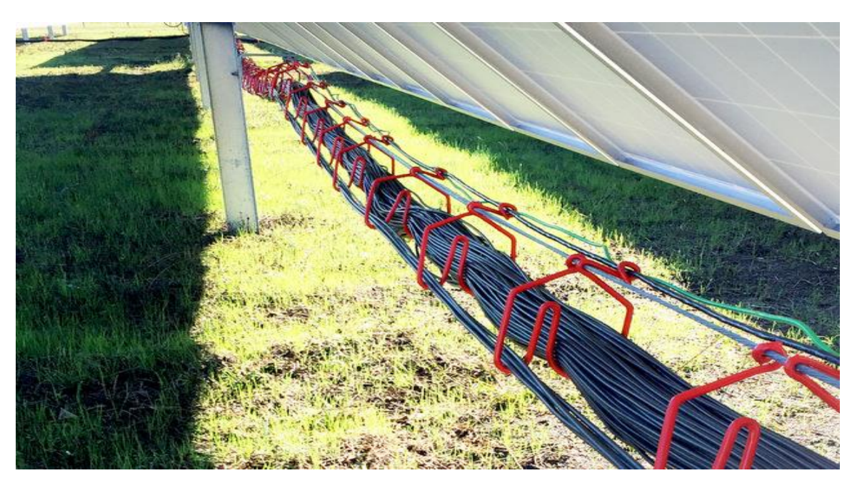
Image 3: Hanging Harness System for DC Cabling between Panels and Inverters

Electrical wiring (DC) will connect the panels to inverters, which will convert the power from DC to AC. The AC will be stepped up through a transformer from the inverter output voltage to 34.5 kV and brought via the collection cables to the Solar Project Substation. The DC cabling will be mounted underneath the panels in a hanging harness system (see Image 3). Use of this system minimizes soil disturbance and trenching along every row of panels. The AC collection system between the inverters and Solar Project Substation will be located in a below-ground trench (approximately four feet deep and one to two feet wide). Below-ground AC collection systems from the inverter skids to the Solar Project Substation will be installed in trenches or plowed into place at a depth of at least four feet below grade. During all trench excavations the topsoil and subsoil will be removed and stockpiled separately in accordance with the AIMP. Once the cables are laid in the trench, the area will be backfilled with subsoil followed by topsoil.