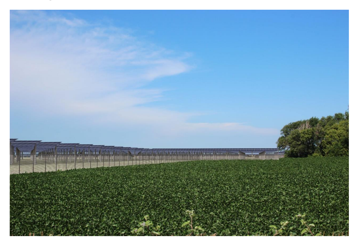
Image 5: Visual Rendering of Red Rock Solar Project from 610<sup>th</sup> Avenue near Residence A Looking Southwest