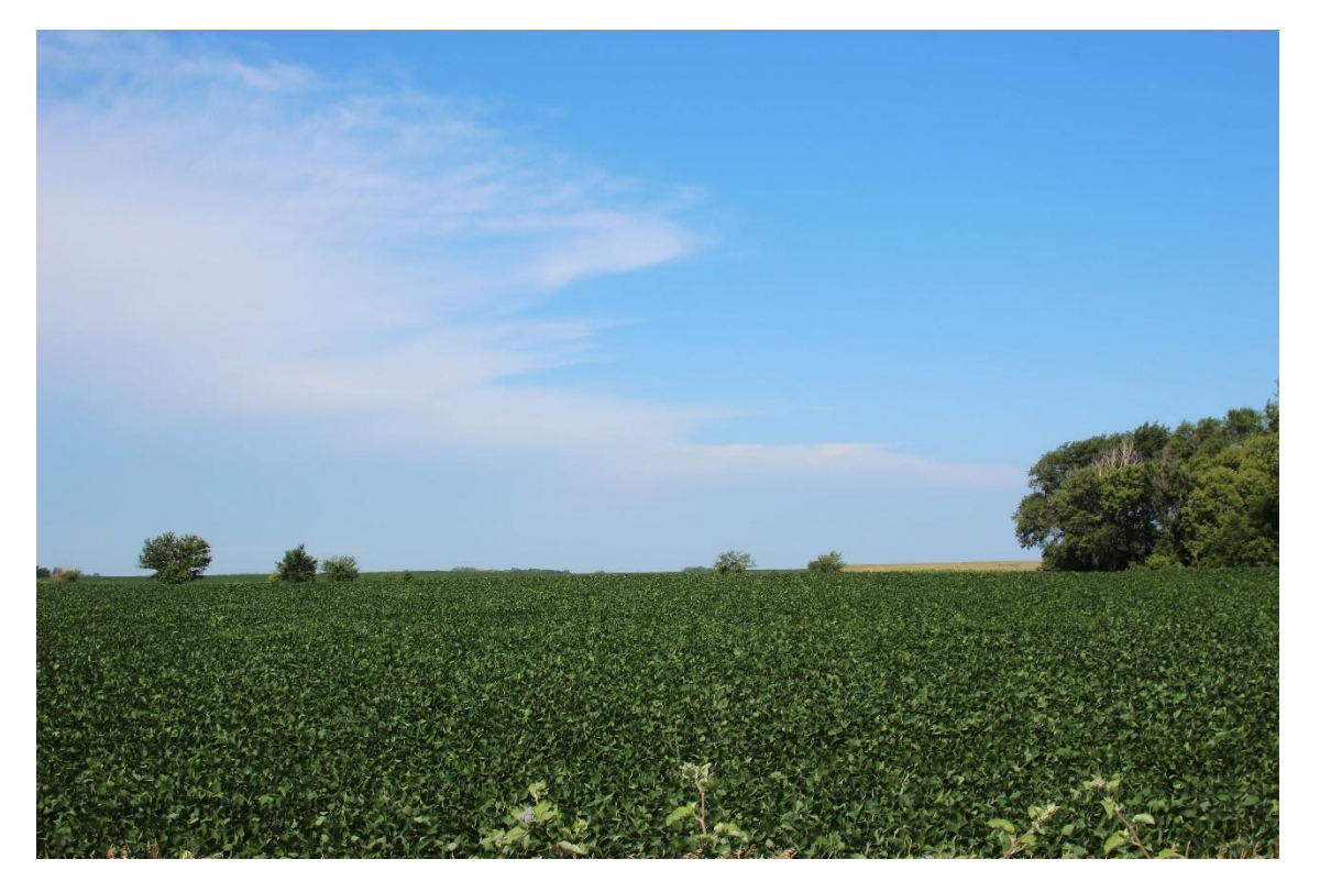
Image 4: Current Conditions from 610<sup>th</sup> Avenue near Residence A Looking Southwest

Image 5: Visual Rendering of Red Rock Solar Project from 610<sup>th</sup> Avenue near Residence A Looking Southwest