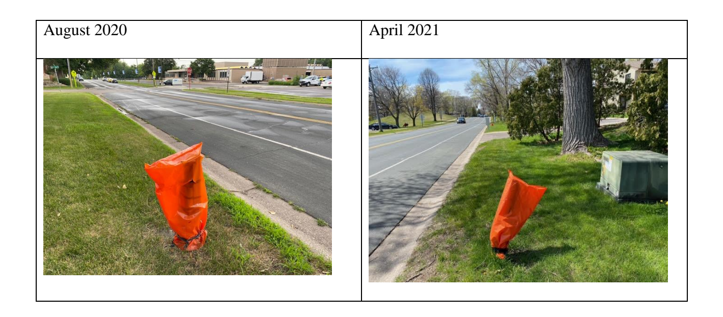
Location: 1241 Theodore Wirth Parkway, Minneapolis